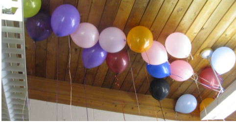
SURPRISE FROM STAFF!