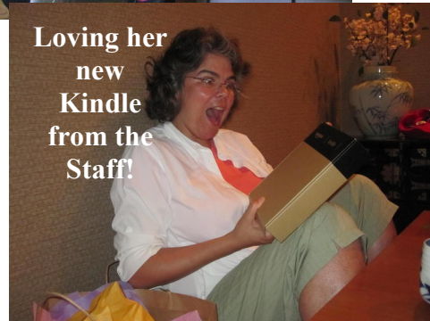
Loving her new Kindle from the Staff!