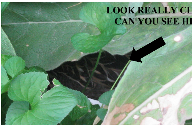
NESTING BY THE SUNDAY SCHOOL WING!